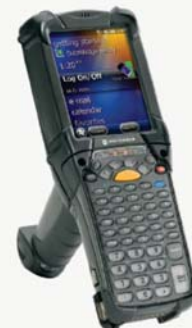
DP/SCAN is compatible with various devices including Motorola's MC9200-G shown above.

The impact of this is that the user that is performing the count must now physically scan the inventory item for it to show up as "counted" in this count or it will be "written off." This prevents people from getting lazy and just entering items they "believe" to be there and they are not. If it's not scanned, it's not there and people can now be held accountable!